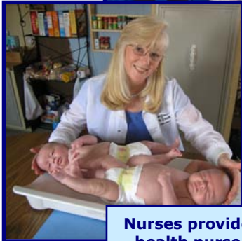
Nurses provided 3,945 public health nurse visits in 2009