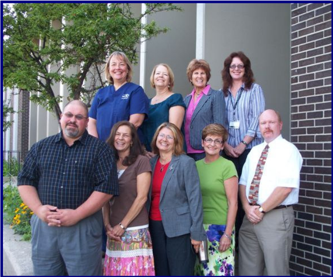
St. Clair County Health Department Leadership 2009

To assure the accessibility of appropriate and quality personal, public and environmental health services to St. Clair County residents and their families.