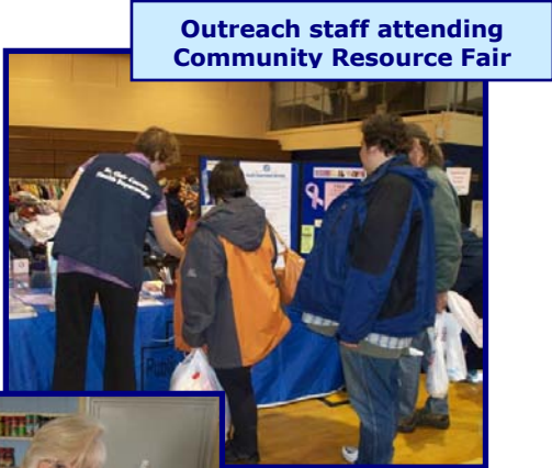
Outreach staff attending Community Resource Fair

While consumers’ need for health department resources dramatically increased with the economy in 2009, state and local budgets were significantly trimmed. Nursing Division staff again demonstrated resilience, flexibility and professionalism to more than meet the challenge.