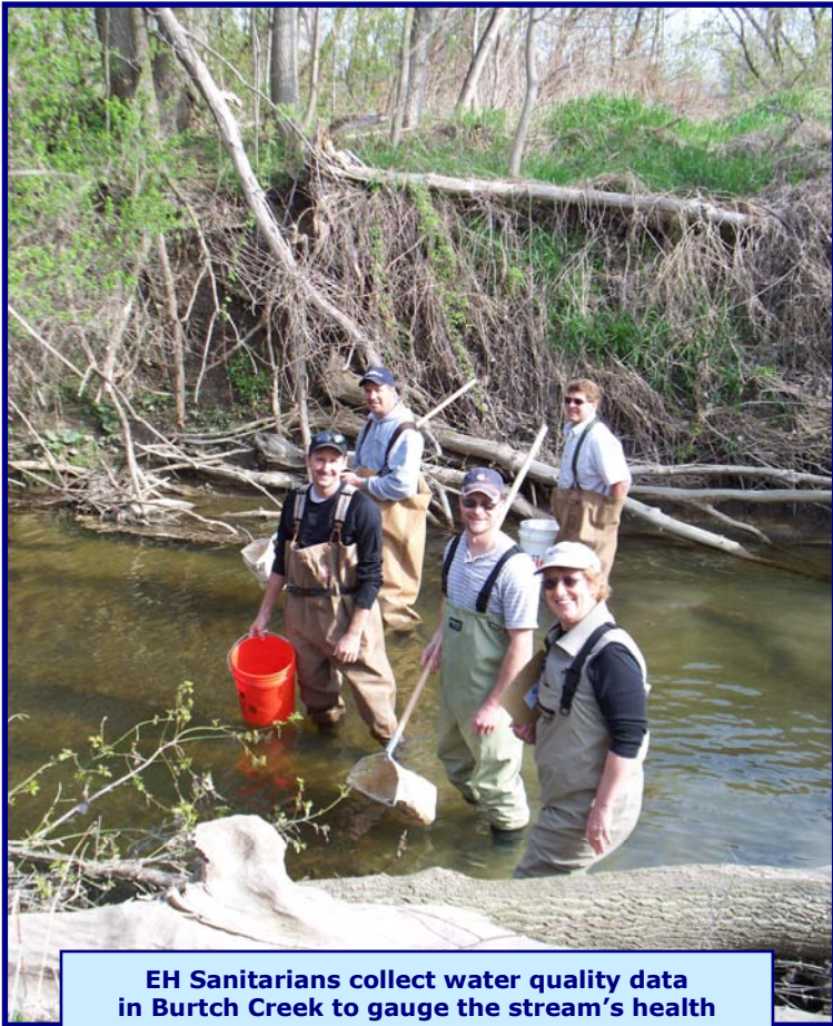
EH Sanitarians collect water quality data in Burtch Creek to gauge the stream's health