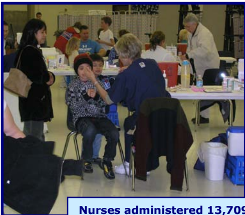
Nurses administered 13,709 H1N1 vaccines in 2009

The introduction of the H1N1 virus that started in the spring of 2009 commanded the attention and targeted activity of the Nursing Division through the end of the year. Health department nurses were introduced to and trained in the administration of injectable and nasal H1N1 vaccine. These nurses vaccinated eligible health department staff and retired health department nurses and community nurse volunteers in preparation for mass community clinics which immediately followed. Mass community clinics were coordinated through all school districts in the county and the local colleges. The flexibility and commitment of all nursing division staff to address this significant public health initiative was impressive, commendable and a great action to witness.