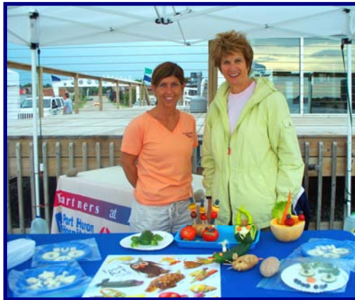
The Health Education team encourages residents to Eat Fresh....Buy Local at the Farmer's Market by providing a "Food Art" activity

The Health Education Division promotes healthy lifestyle behaviors among St. Clair County residents through programs, presentations, community assessment activities and the provision of resources. Nearly 200 presentations were provided to 6,800 participants during 2009 on health promotion and communicable disease prevention topics.